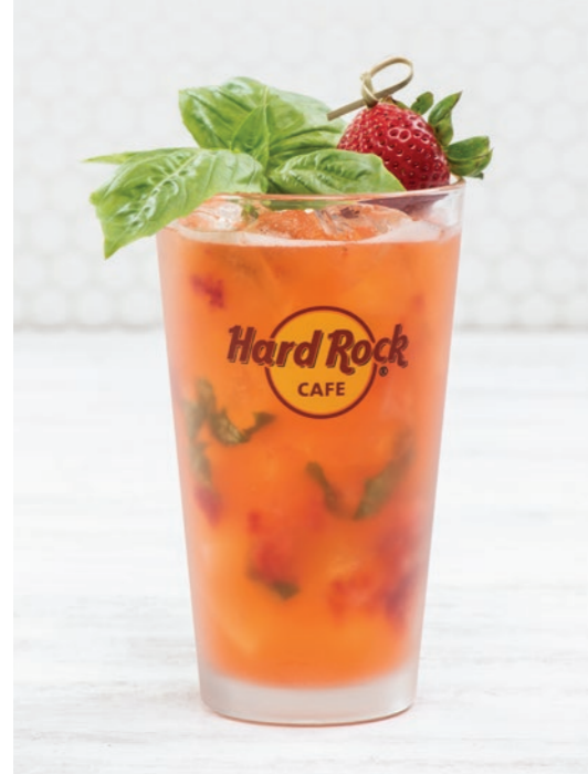
STRAWBERRY BASIL LEMONADE

We hold allergy information for all menu items, please speak to your server for further details. If you suffer from a food allergy, please ensure that your server is aware at time of order. † Contains nuts or seeds. 2000 calories a day is used for general nutrition advice, but calorie needs vary. Additional nutritional information is available upon request.