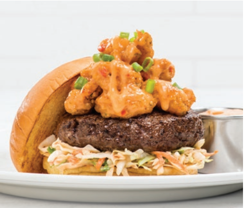
SURF & TURF BURGER