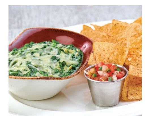
SPINACH & ARTICHOKE DI

Three mini-burgers with melted American cheese, crispy onion ring and creamy coleslaw on a toasted brioche bun.* $13.95 (1810 cal)