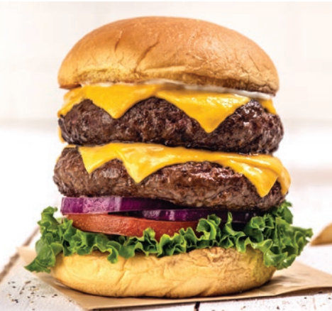
DOUBLE DECKER DOUBLE CHEESEBURGER

We hold allergy information for all menu items, please speak to your server for further details. If you suffer from a food allergy, please ensure that your server is aware at the time of order. † Contains nuts or seeds. * These items contain (or may contain) raw or undercooked ingredients. Consuming raw or undercooked hamburgers, meats, poultry, seafood, shellfish or eggs may increase your risk of foodborne illness, especially if you have certain medical conditions. 2000 calories a day is used for general nutrition advice, but calorie needs vary. Additional nutritional information is available upon request.